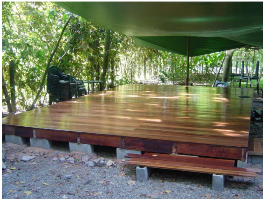
The completed floor. Look at it gleam!

Thank you! To Surf For Life for your hard work and donations – and also to those of you who sent money in to help with the cost of the floor.