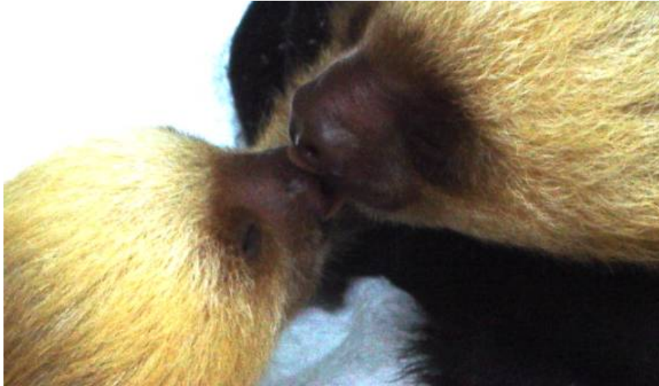
Sloth buddies at the Jaguar Animal Rescue Center in nearby Cocles, where Nanci visited recently to learn what it's all about.