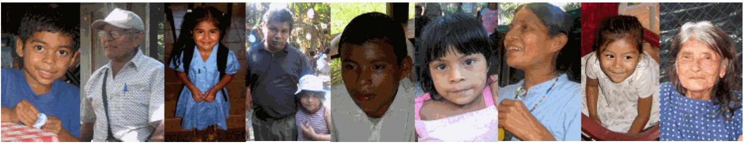
February 28, 2010