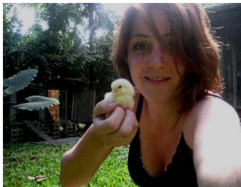
...and she fell in love with the baby chicks running around the yard

She really jumped in and got to work, helping at the Community Kitchen on Christmas Eve, and working hard at the Christmas Party on Saturday the 26 th . She was an all around delight to have here.