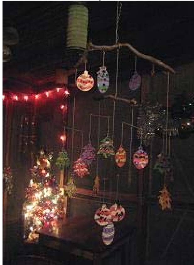
An environmentally friendly Christmas Tree and homemade ornaments made by everybody mark Christmas at The Bridge

January 16, 2010