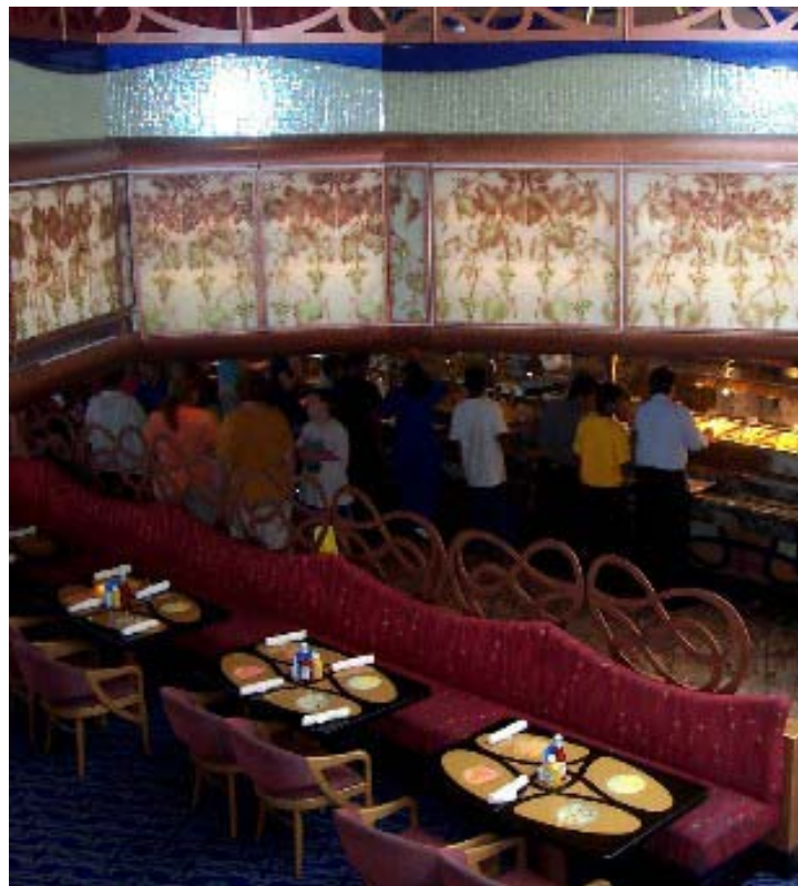
With the fun of touring over, the travelers get down to some serious business – lunch! And what a lunch it was. Two stories of every kind of food on the planet – all they could eat.