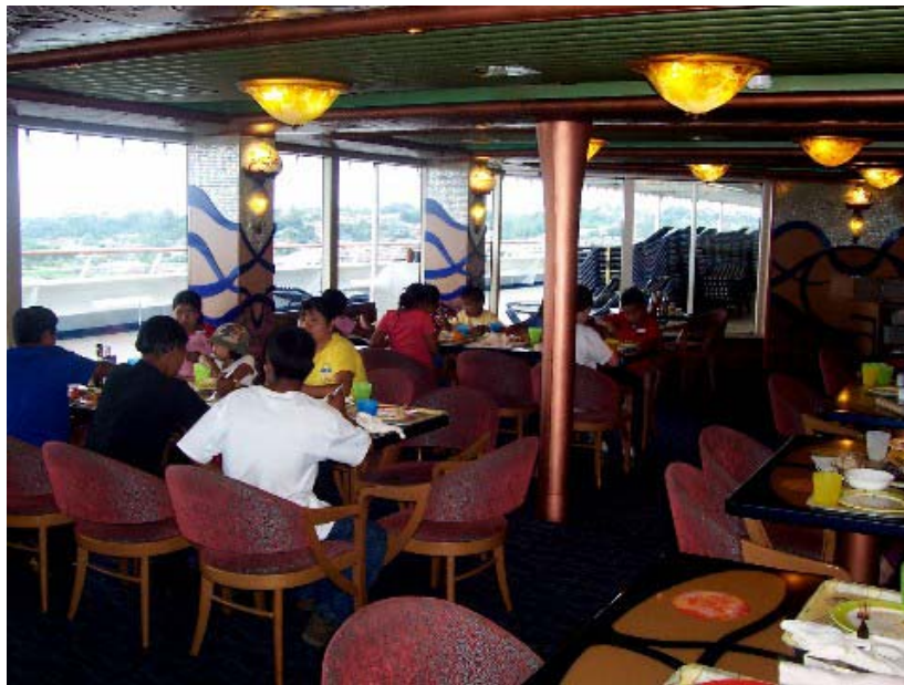
A corner of the amazing Lido dining room was reserved just for us, as we enjoyed a great lunch.