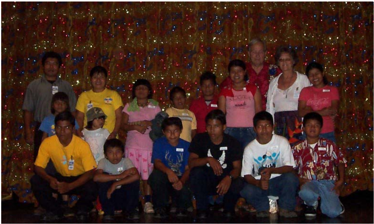
Our trusty guides got us all up on stage for a group photo.