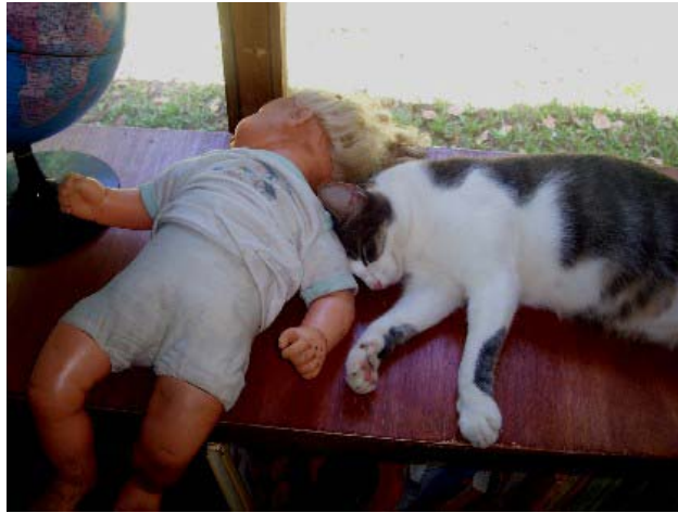
"Little", is sleeping it off. Even the dolly is tired after being carried around by several little girls for the whole morning